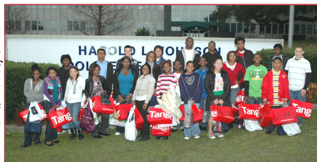
Above: The kids last year after their shopping trip.

We have removed some long-standing names from our prayer list. If names of those you care for need to be returned to the list, please call or e-mail the Cathedral office to ask that they be added.